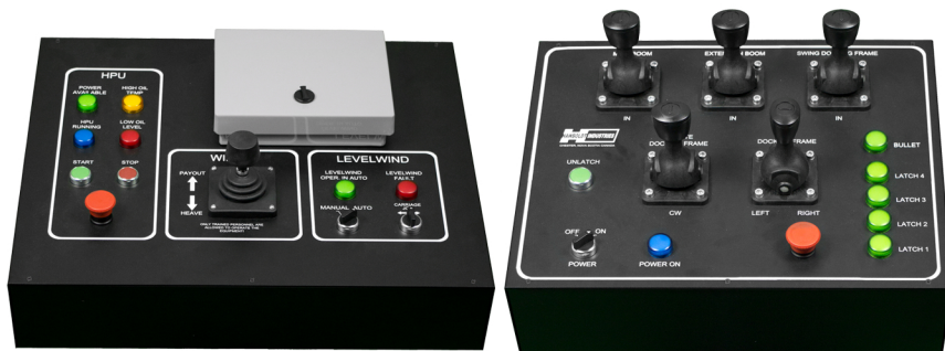
Mock-up of Hawboldt Industries ROV LARS controls

A full mock-up of the operator controls is offered, enabling simulation training on the same controls used in the field.