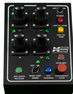
Mock-up of Hawboldt Industries AUV LARS controls